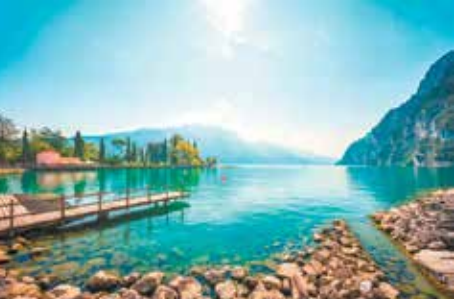
8 DAYS HALF BOARD