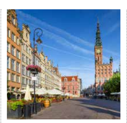
Clean and clear - the car-free Dluga

Reminders of the league's legacy abound; a ship motif, a classic Hanseatic symbol, appears on many buildings, while the red and white of Gdansk's flag were the